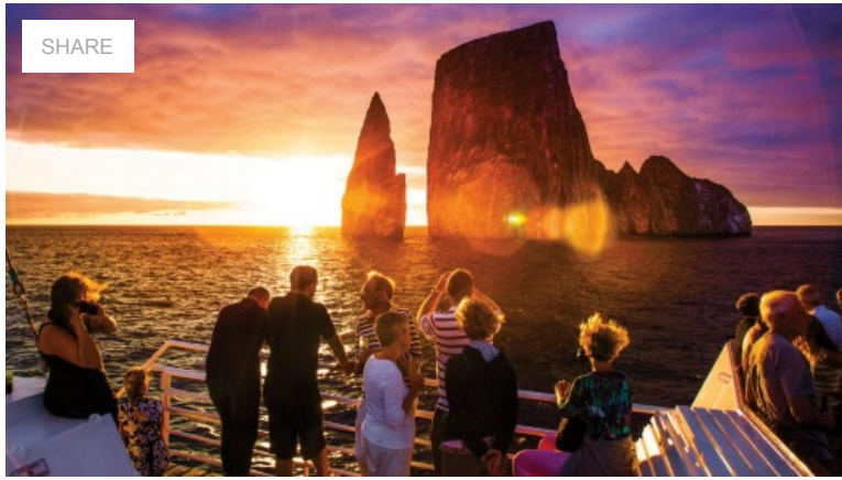
Charter a private boat to the Galapagos Islands.