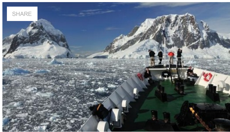
Jump on an exclusive sail and ski expedition to Antarctica by Chimu Adventures.