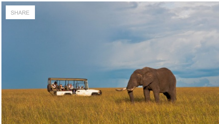
Masai Mara National Park in Kenya.